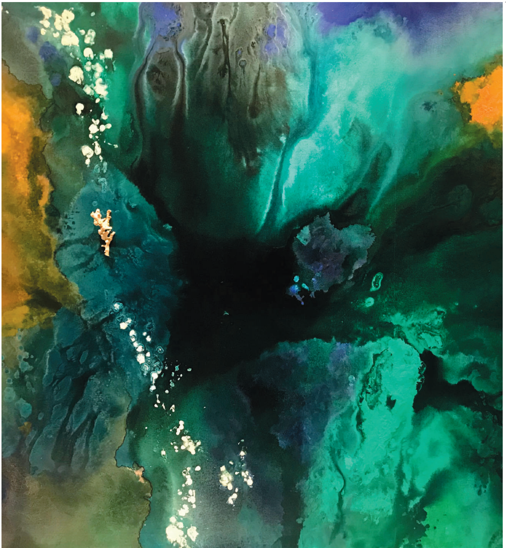
“Great Barrier Reef and Specimen” - Detail, from a painting 60”x84”